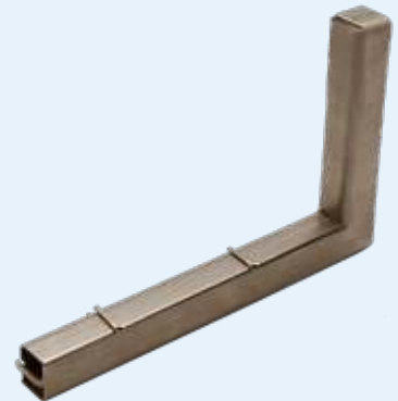
L Shaped Weep Hole

For sales or technical assistance please call